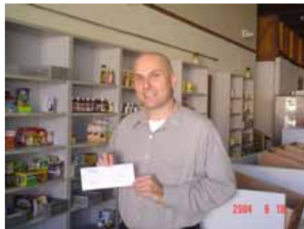
Concho Valley Regional Food Bank

Trans Texas Southwest Credit Union's "Skip-A-Payment" program is offered each year to help members with their Holiday related expenses. Each loan skipped is charged a $15 fee; half of the fee is donated to 3 predetermined local charities.