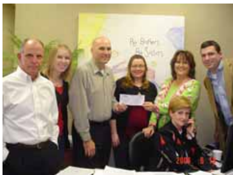
Big Brothers Big Sisters

Trans Texas Southwest Credit Union's "Skip-A-Payment" program is offered each year to help members with their Holiday related expenses. Each loan skipped is charged a $15 fee; half of the fee is donated to 3 predetermined local charities.